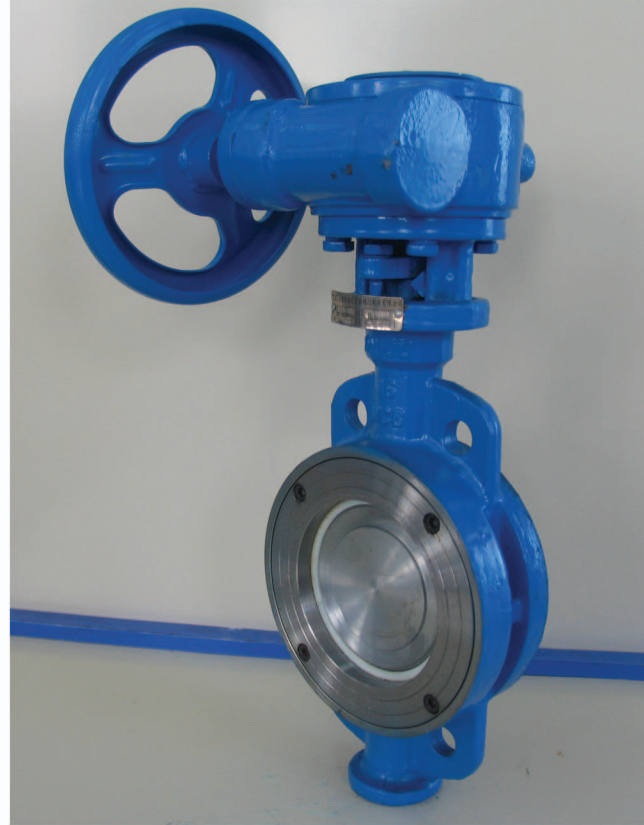
No.2 double eccentric butterfly valve White ring is PTFE sealing, this valve body must touch fluid, and the performance of sealing is not very good compare with NO.1

Face to face of above three kinds of vavle is same. It is according to EN558.End flange is according to ANSI125/150.