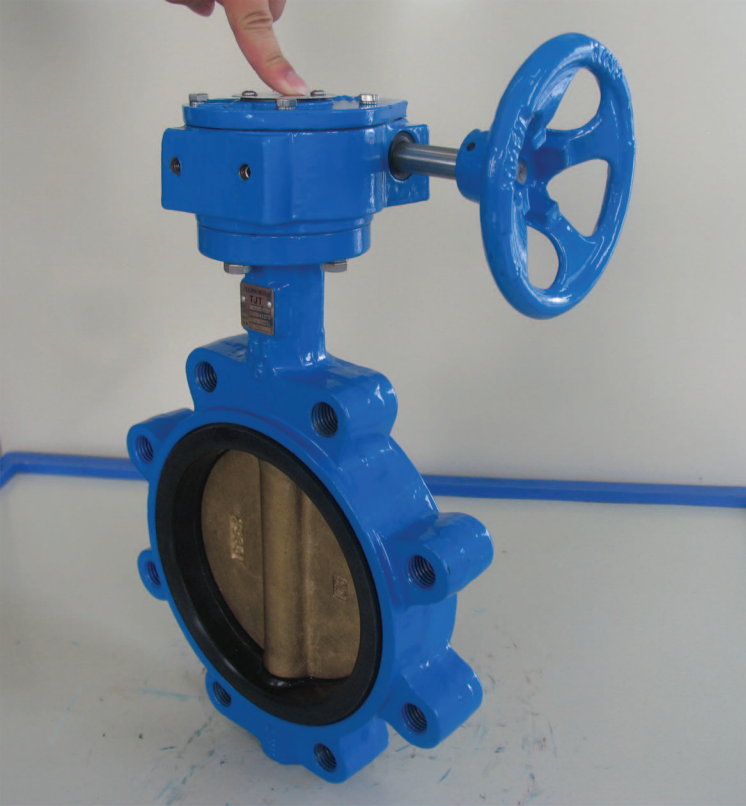
No.1 lug & concentric butterfly valve Black ring is seat, integral lined body so that body didn't touch any fluid. You can choose any materials of body This cost is cheaper.